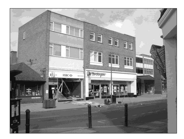
Evidence of the ram-raiders early in the morning of Saturday 14th July 2007